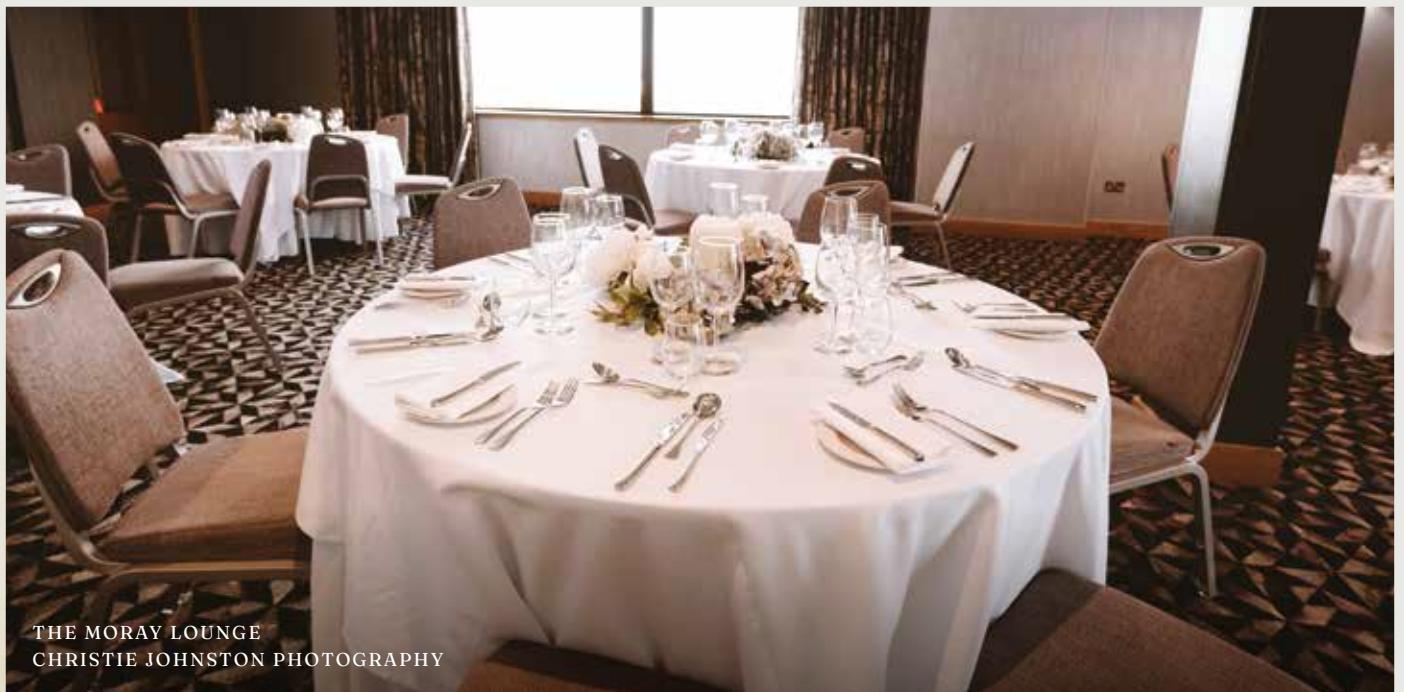
THE MORAY LOUNGE