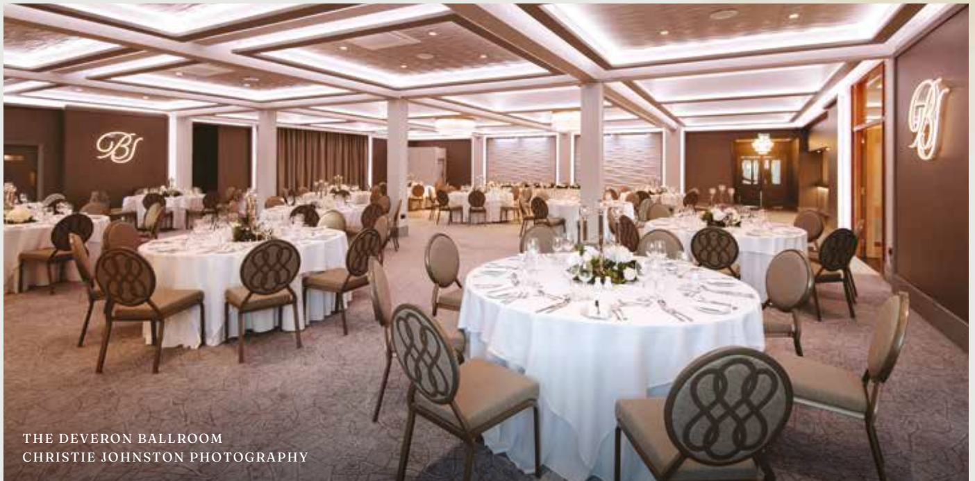
THE DEVERON BALLROOM