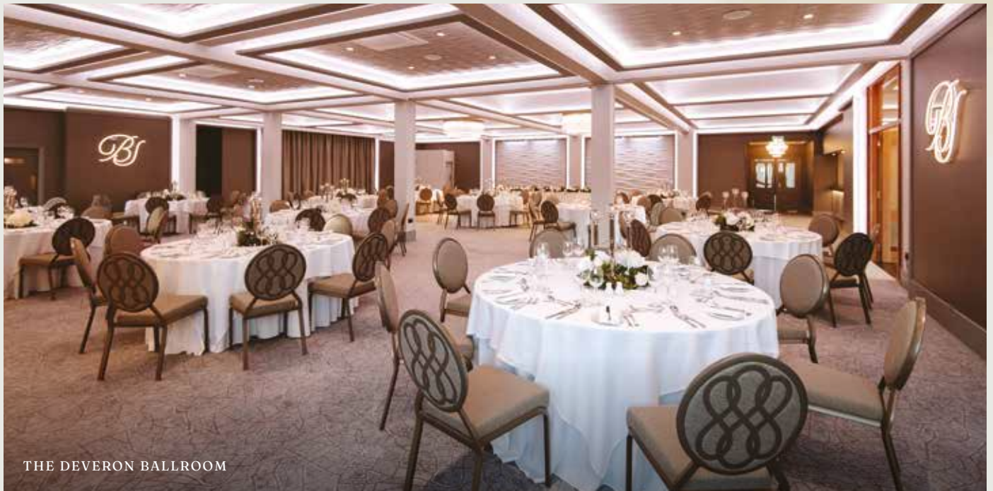
THE DEVERON BALLROOM