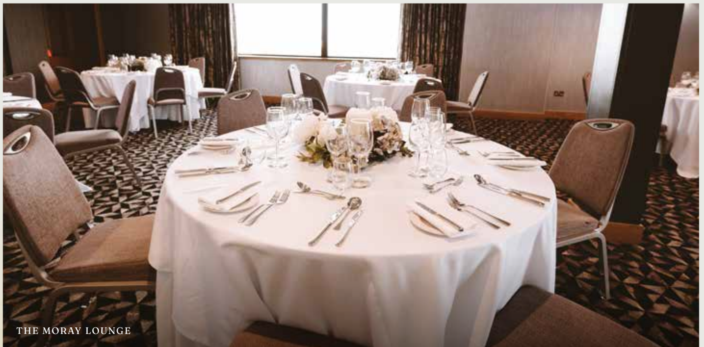
THE MORAY LOUNGE